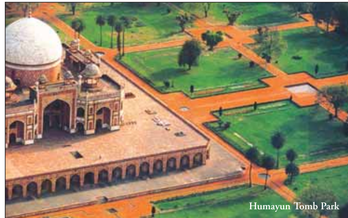
Humayun Tomb Park

Along the road is the entrance to Sanctuary, which covers an area of 26 sq. km. Though not much wildlife exists in Asola, it is full of all kinds of birds and smaller animals.