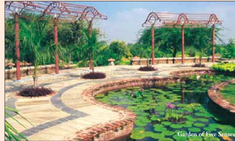
Garden of Five Senses