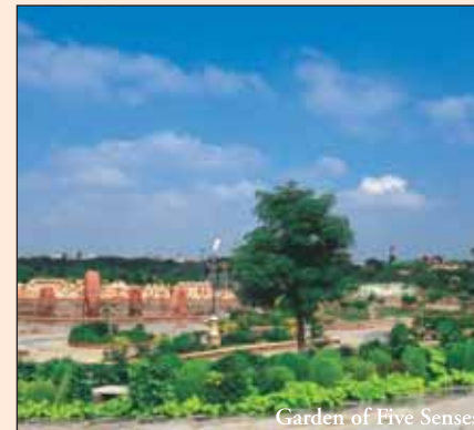
Garden of Five Senses

The Garden of five Senses is young and still evolving, the growing species of plants and trees are filling spaces, and the built environment is changing with time. Garden of Five Senses featured in the Limca Book of Records in 2004 for its