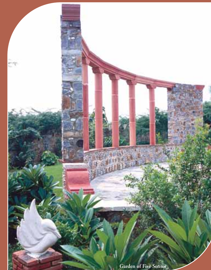
Garden of Five Senses