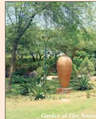
Garden of Five Senses