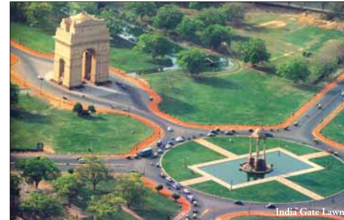
India Gate Lawns

unique concept of Solar Energy Park. Phone : 65651083; Telefax: 29534519