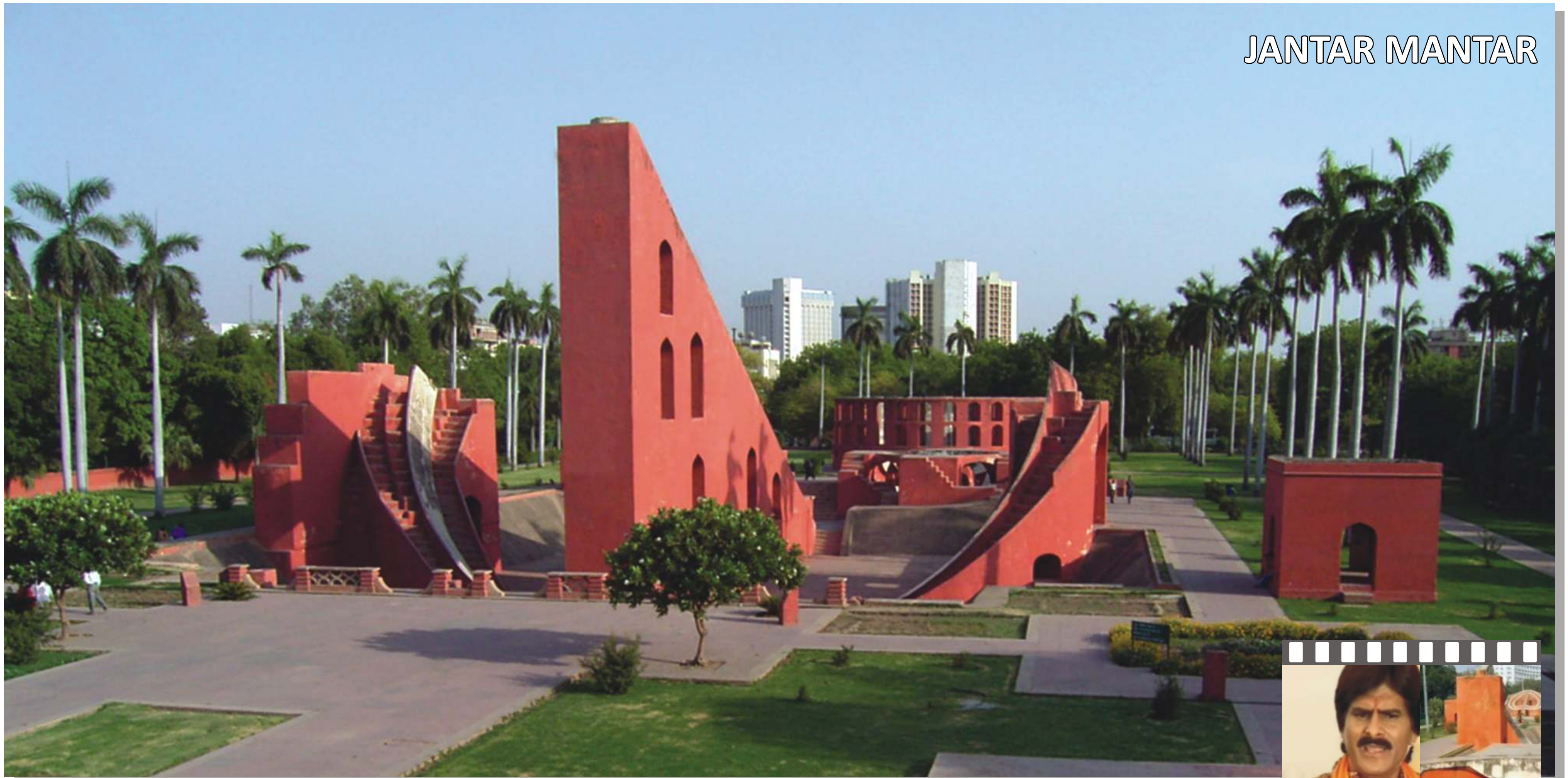
Located in the Parliament Street, south Connaught Circle, historic Jantar Mantar is an Observatory built by Maharaja Jai Singh, in the year 1724. An enviable location for film shoots, right at the heart of the city.