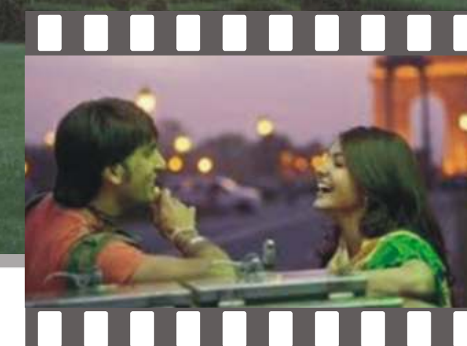
BAND BAAJA BAARAT