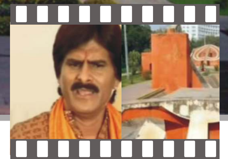
AB HOGA DHARNA UNLIMITED