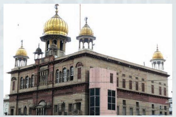
Gurudwara Sis Ganj: Where Guru Tegh Bahadur was beheaded

Sis Ganj , the welcoming Sikh temple that was built where Guru Tegh Bahadur, the ninth Sikh guru, was beheaded by Aurangzeb. The trunk of the banyan tree under which the guru was killed is still there on the premises. Before you enter the gurudwara , take off your shoes and wash your hands and feet.