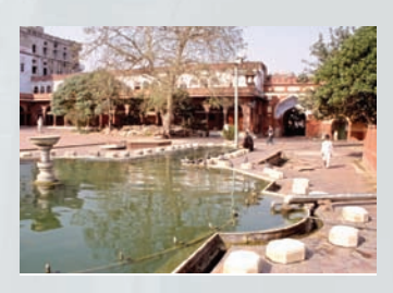
Fatehpuri Mosque: Proportionally not as perfect as Jama Masjid

next to the Gauri Shankar Temple, which has an 800year-old brown lingam (Lord Shiva's phallic symbol) encased in marble. Next down the street is Gurudwara