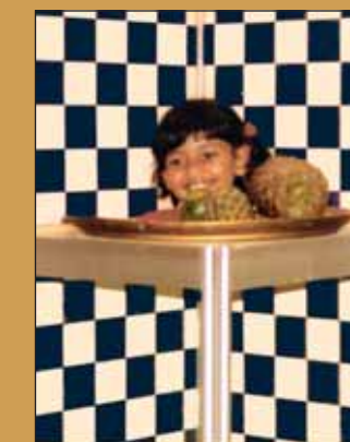
National Science Centre