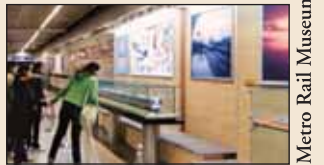
Metro Rail Museum

The museum show cases the history growth, development and technical features of the Delhi metro rail project. The museum entry is by token costing Rs. 6 per person.