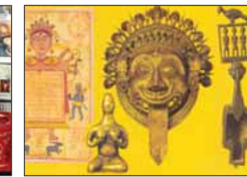
Museum of Folk & Tribal Art

account of developments relating to technology, toilet related social customs, toilet etiquettes, prevailing sanitary conditions and legislative efforts of the times.