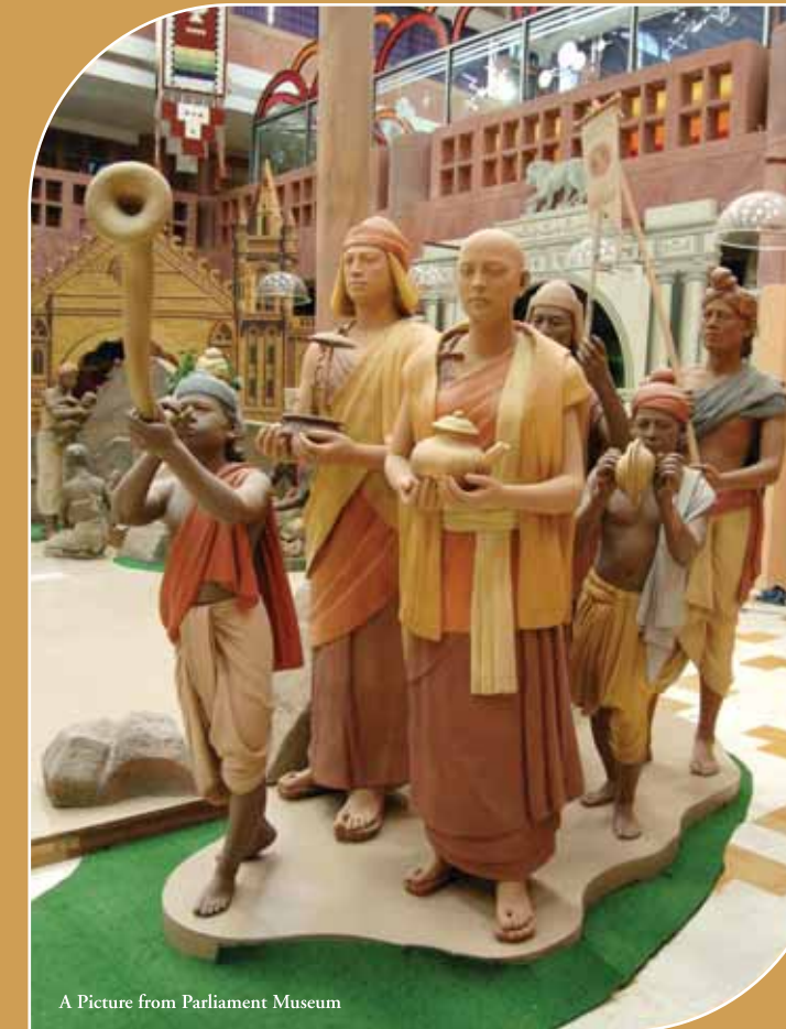
A Picture from Parliament Museum