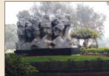
National Gandhi Museum

The museum has on display a few personal belongings of Gandhiji, who was a man of few things. A stone bowl and a brass plate, the clothes Gandhiji had worn on the day he was assassinated, a pair of wooden sandals, his walking bamboo stick, a few reed pens he carved himself and a diary in his own handwriting are the few interesting items on display. There is a library and an information centre in the same complex.