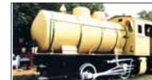
National Rail Museum

This unique museum has a fascinating and exotic collection of over 100 real size exhibits of Indian Railways. Static and working models, signaling equipments, antique furnitures, historical photographs and related literature etc. are displayed in the museum. The line-up of old coaches includes the handsome Prince of Wales Saloon, built in 1875. Not to be outdone is the Maharaja of Mysore's Saloon built in 1899 with its brocade covered chairs and an elegant rosewood bed; one can peer in through the windows for a good look. A star attraction is the Fairy Queen, born in 1855 and considered to be one of the best preserved steam locomotive engines of her age. A ride in joy train and mono rail (PSMT) is the most exciting experience besides boating. Do not miss the handsome Fire Engine on your way out.