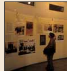
The Challo Dilli Museum