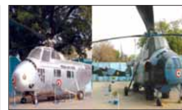
Air Force Museum