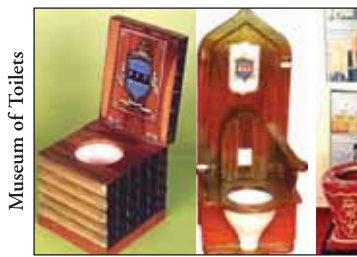
Museum of Toilets

The founder of Sulabh International Social Service Organisation Dr. Bindeshwar Pathak envisioned this one of the rare museums, which has a rare collection of facts, pictures and objects detailing the historic evolution of toilets from 2500 BC to date and provides a chronological