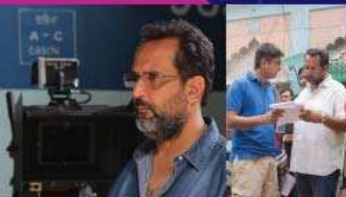
AANAND L RAI

AANAND L RAI is the Director and Producer of major box office hits like Tanu Weds Manu , Tanu Weds Manu Returns and Raanjhanaa