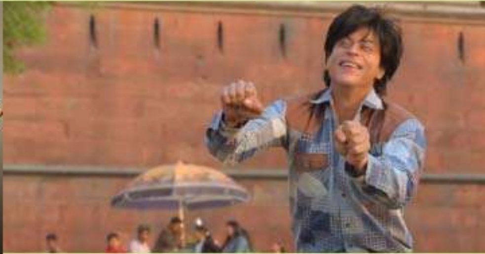
Scenes from films set in Delhi (left to right) Piku, Fan, Cooking with Stella and Eat, Pray, Love

The tears which well over through tragedy. The gasp of shock at a perfect horrifying moment. All together, Nirvana in three hours woven around an interval. Through stories of people within a context and space. Of a locale and people belonging to the city. We are thus glad that cinema is finding Delhi to be the ideal destination. The ancient city, the ultramodern megapolis. Delhi and Cinema complete each other. Through the city's grand expanse and by the kind generosity of the capital that has welcomed one and all to make him and her its own. The grand family of the DilliWallah . For us, the guardian of each person's passage through Delhi, the fact the both the Indian and World Cinema finds in Delhi the ideal destination to weave in their story, provides us great joy coupled with a huge sense of responsibility.