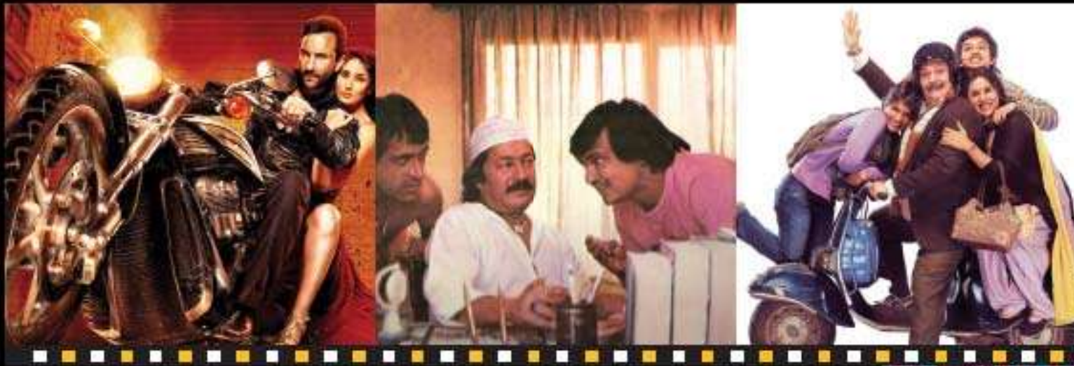
Scenes from films set in Delhi (left to right) Agent Vinod, Chashme Baddoor, Do Dooni Chaar, Silsila and Sultan